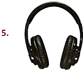
Above is known as a headphone.